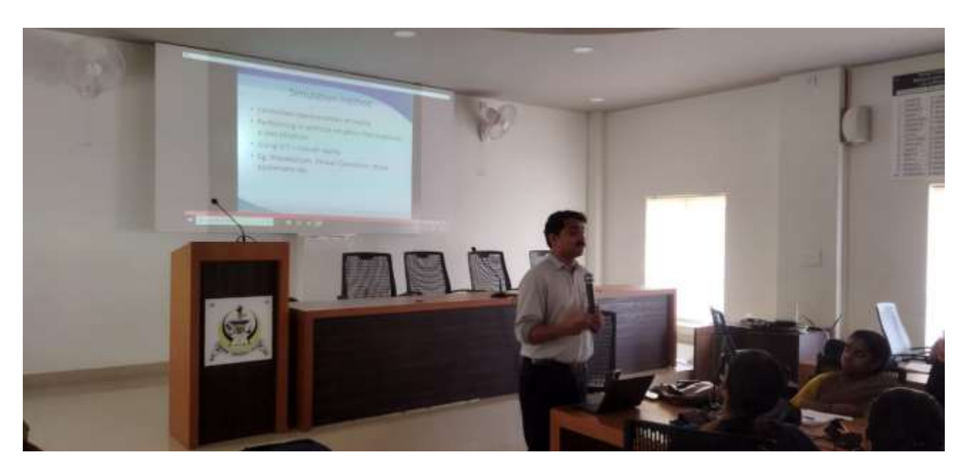
PTEP- Prospective Teacher Empowerment Programme- K-TET Coaching Class 18 April 2022 – 26<sup>th</sup> April 2022

Farook Training College PTEP is planned to organize an online orientation program (for general paper and Education) in connection with the K-TET Examination be held on 4<sup>th</sup> & 5<sup>th</sup> May 2022.