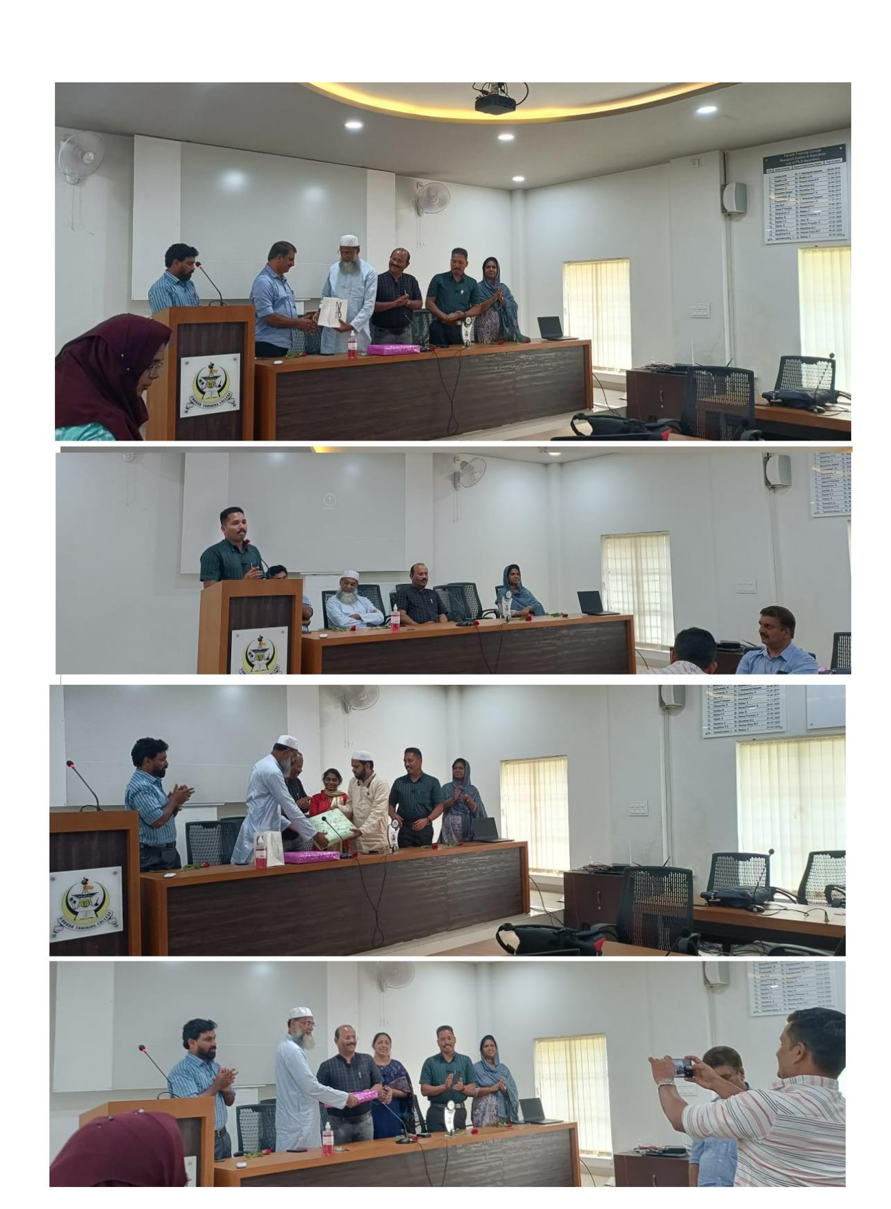
Prepared by Media Cell, FTC