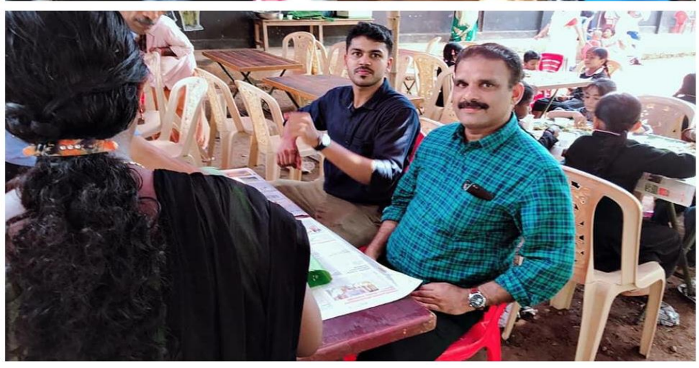
prepared by Media Cell, FTC