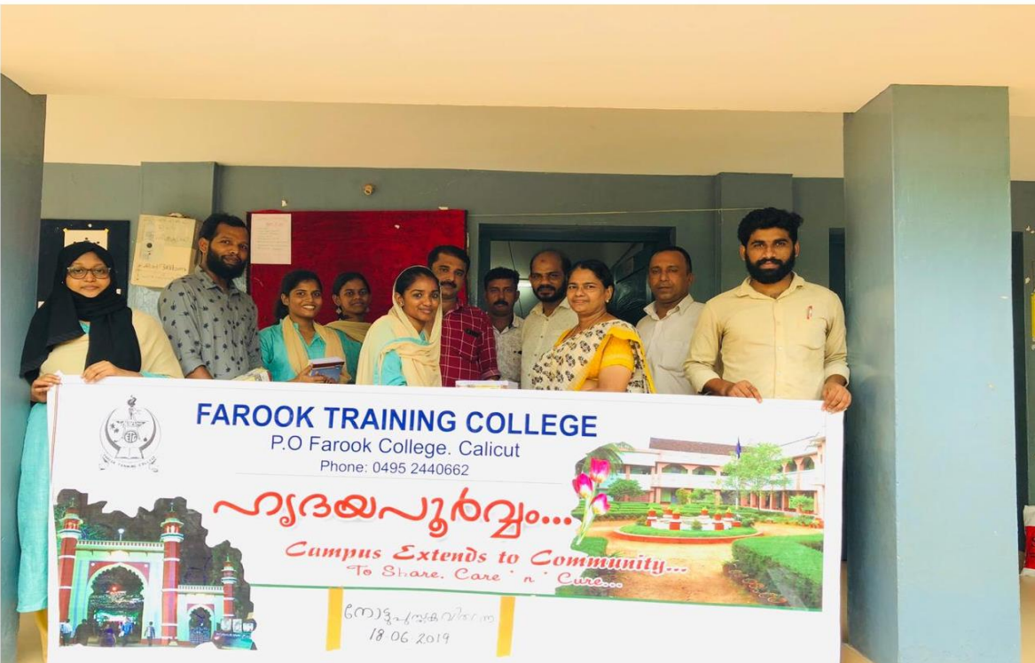
Prepared by Media Cell, FTC