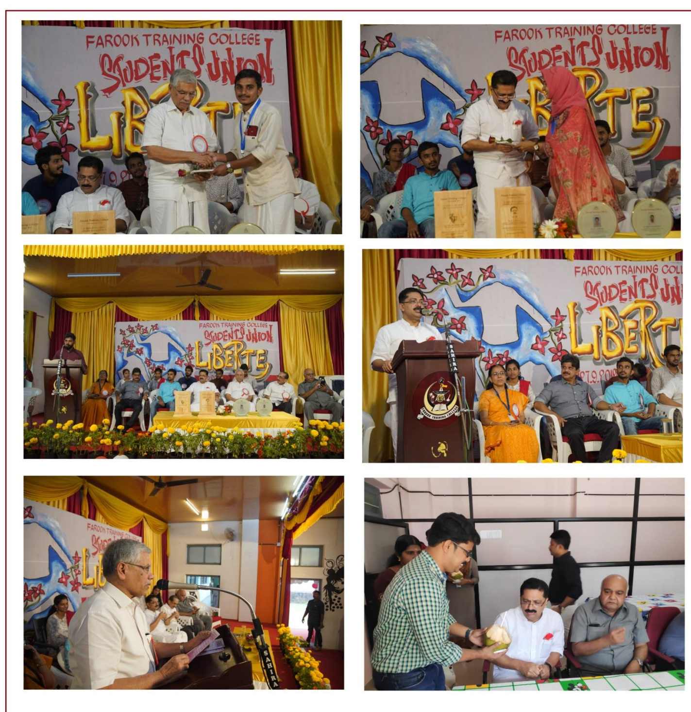
Media Cell, FTC