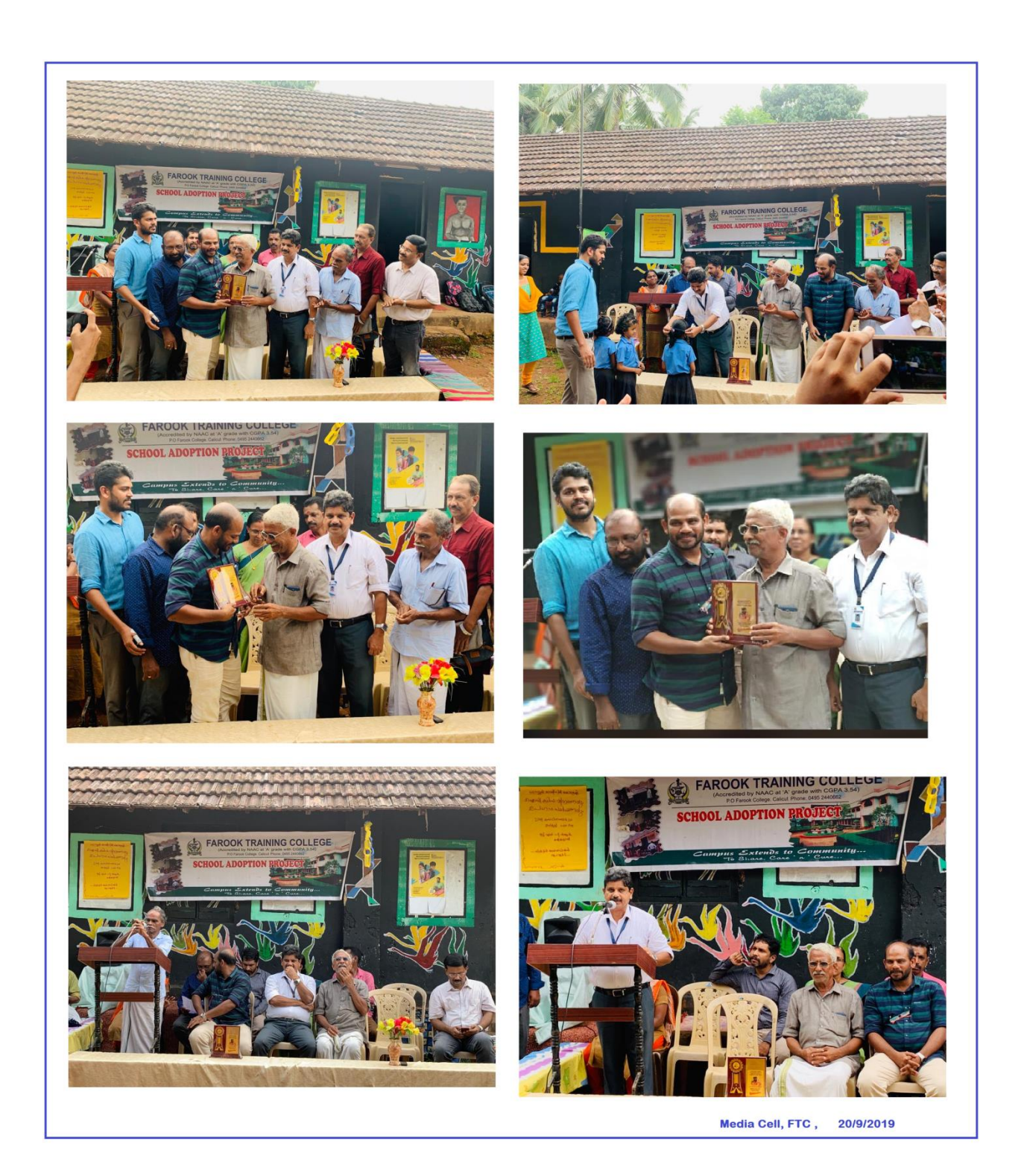
Page | 34